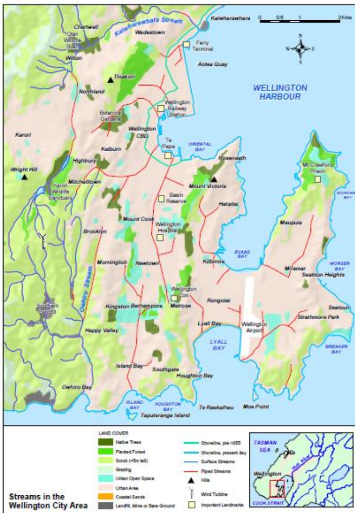
Figure 1. The Wellington City streams map

The embankments proposed were assessed over the criteria: geotechnical requirements for earthquake resistance, maintenance requirements, area of disturbance, morphological integration and ecological integration, aesthetic impact and cost (Table7, GHD 2015).